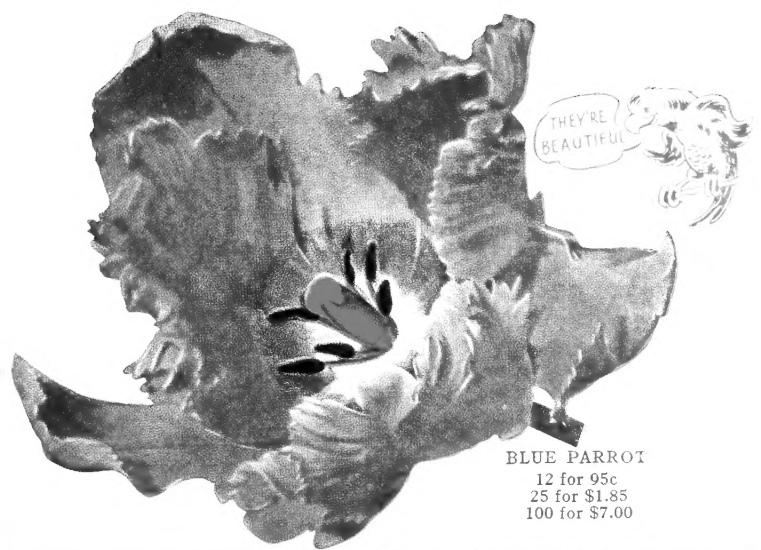
BLUE PARROT 12 for 95c 25 for $1.85 100 for $7.00